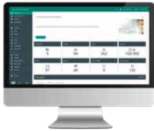
2N® ACCESS COMMANDER