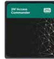
2N® ACCESS COMMANDER BOX