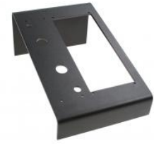
Dual Desk Stand