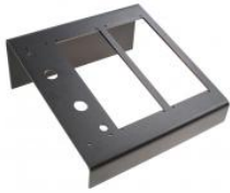
Triple Desk Stand