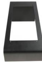
Single Desk Stand