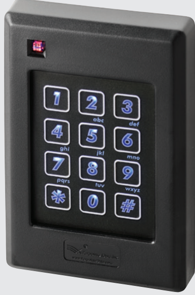
CSR-6.4L mounts to single-gang wall switch box

Conekt Mobile Smartphone Access Control Solution