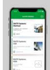
Digital Key Bluetooth LE NFC - Near Field Communication