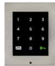
2N® ACCESS UNIT KEYPAD