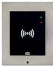
2N® ACCESS UNIT RFID

ord. 916009 (125kHz) ord. 916010 (13.56MHz)