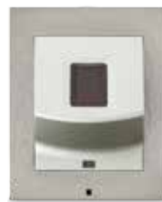
2N® ACCESS UNIT FINGERPRINT READER