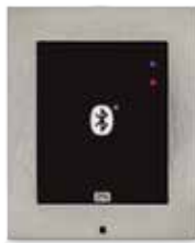
2N® ACCESS UNIT BLUETOOTH

ord. 916009 (125kHz) ord. 916010 (13.56MHz)