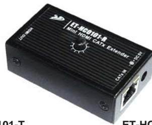
ET-HC0101-R Mini HDMI CAT-5 Receiver