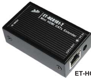
ET-HC0101-T Mini HDMI CAT-5 Transmitter

The HDMI Expander Family brings you endless possibility for digital signage, public display and large scale demonstration. Where crystal-clear digital video needs to be broadcasted, these expanders can bring your distribution system to the next level. The Mini HDMI Cat-X Extender pair is the perfect solution for simple point-to-point HDMI installation. With its compact innovative design, it greatly reduces installation spaces, conveniently extends HDMI signal without quality downgrade.