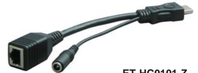
ET-HC0101-Z HDMI CAT-5 Receiver with Power (For SAMSUNG / LG LCD)