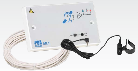
Typical ML1/K counter/ticket booth application: