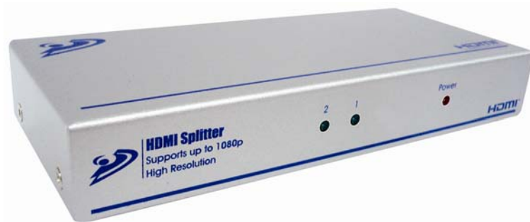
SP-00102-0B 2-Port HDMI Splitter