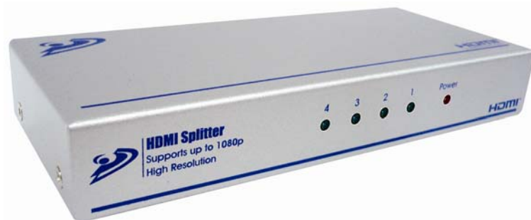
SP-00104-0B 4-Port HDMI Splitter